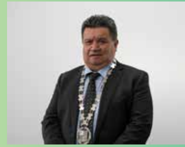
Mayor Gary Petley

0274 836 809 Gary.Petley@southwaikato.govt.nz