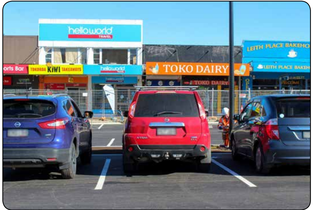
Pictured above: Part of the carpark in Leith Place is now open for users.

On SH1 the Downer team continues to lay the stormwater line and install the mega pit stormwater drains.