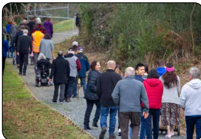
Let's walk: Local residents take a tour of the new walkway in Tirau.

Mayor Shattock also paid tribute to the many groups and individuals who were integral