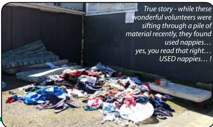
True story - while these wonderful volunteers were sifting through a pile of material recently, they found used nappies... yes, you read that right... USED nappies...!