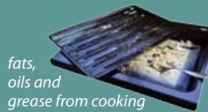
fats, oils and grease from cooking

But wait, there's more... more items that are a problem for our wastewater system.