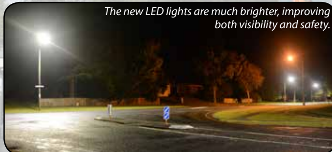
The new LED lights are much brighter, improving both visibility and safety.