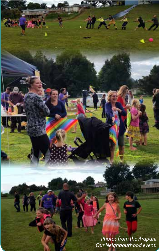
Photos from the Arapuni Our Neighbourhood event.

A big thanks to all our community members and organisations who turn out for these events and lend a hand - we couldn't do it without you. And of course thank you to our community team for organising these events year after year - you guys rock!