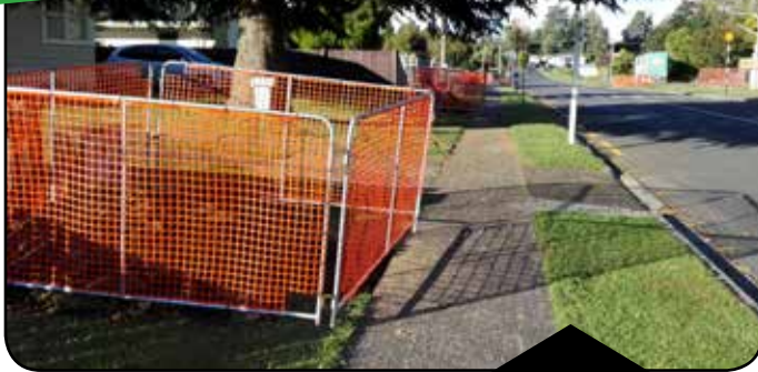
Ultrafast Fibre Limited (UFF) building the new fibre broadband network in Putāruru! Register for streamlined fibre installation at www.fibreiscoming.co.nz .

SOP is pretty hot! A reminder to all our urban doggie owning people (who aren't already on SOP*). If you want to pay registrations that are half the price of the standard fee, apply to Council to become an SOP dog owner before the end of May. * Selected Owner Policy