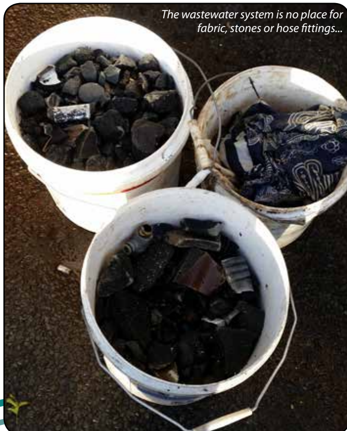
The wastewater system is no place for fabric, stones or hose fittings...

Please help us keep our wastewater system running well by disposing of items correctly. If in doubt, give us a call on 07 885 0340 or ask on Facebook at www.facebook.com/SouthWaikatoDistrictCouncil .