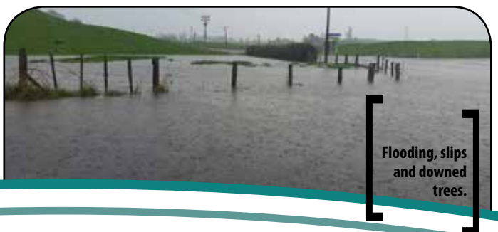
Flooding, slips and downed trees.