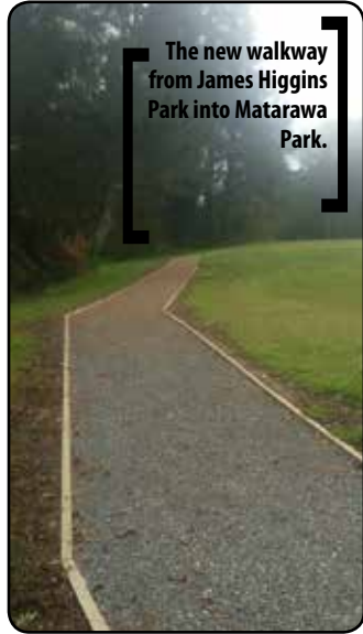
The new walkway from James Higgins Park into Matarawa Park.

The Tirau Domain Concept Plan - collaboration between Council, Tirau Community Board and the community makes for good progress on the plan.