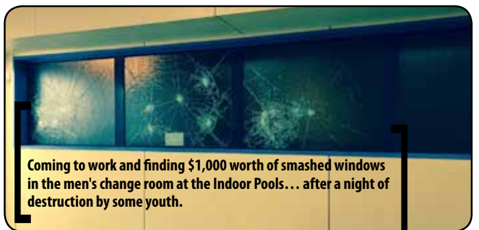
Coming to work and finding $1,000 worth of smashed windows in the men's change room at the Indoor Pools... after a night of destruction by some youth.

Some of our young people pulling poo bags out of dispenser at Lake Moananui. It's a silly waste of staff time to clean it up and ratepayer money restocking it. We encourage anyone one knows who is doing this to report them to Council.