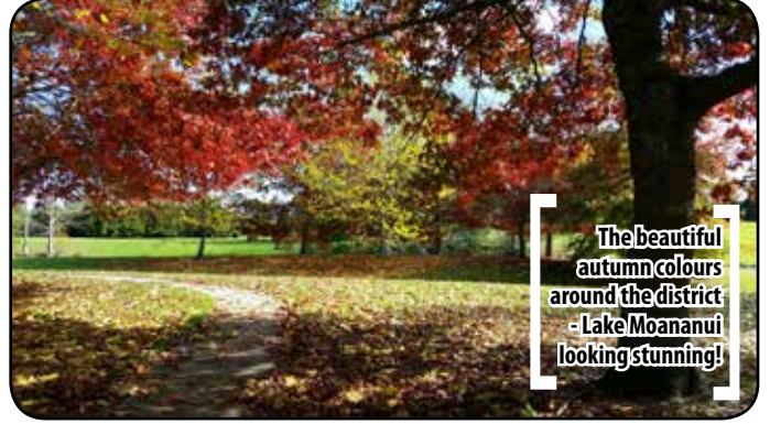
The beautiful autumn colours around the district - Lake Moananui looking stunning!

103 installs of our new mobile phone app Antrenno - on ONE day!