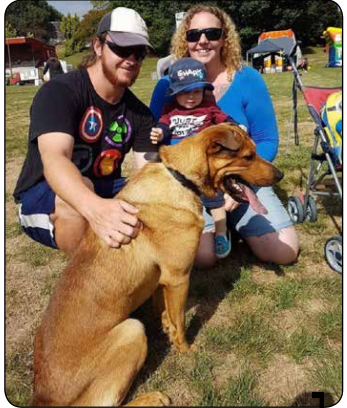
Second chance for 28 dogs to date this year. These dogs would normally have been put to sleep but thanks to the wonderful people in our community who have adopted them through our Rehome Programme, these 28 pooches have found a new FURever home. And they have all been microchipped, registered and desexed.