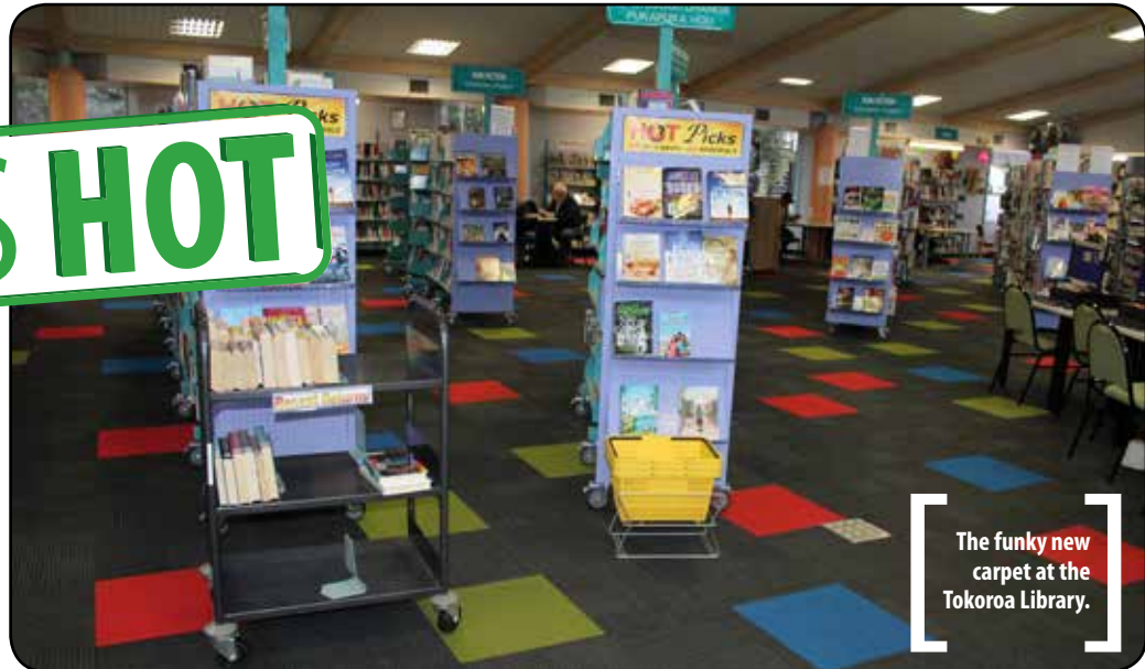
The funky new carpet at the Tokoroa Library.

Response to Animal Control's dog registration reminder mail-out has been really successful.