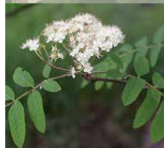
Sorbus aucuparia