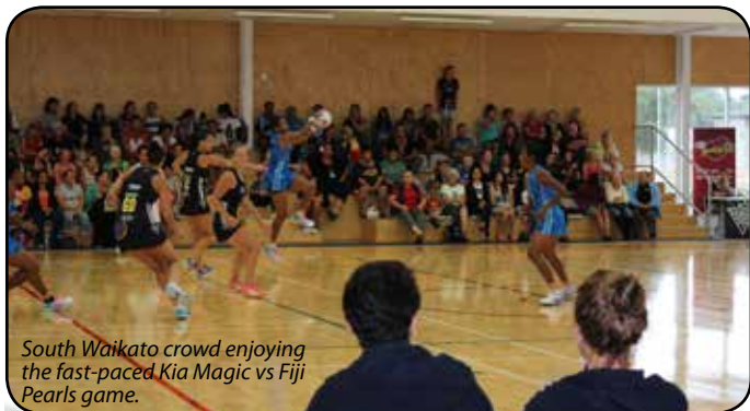
South Waikato crowd enjoying the fast-paced Kia Magic vs Fiji Pearls game.