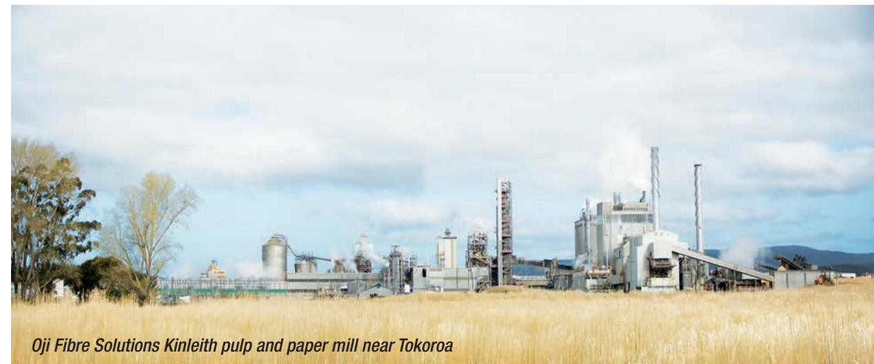
Oji Fibre Solutions Kinleith pulp and paper mill near Tokoroa