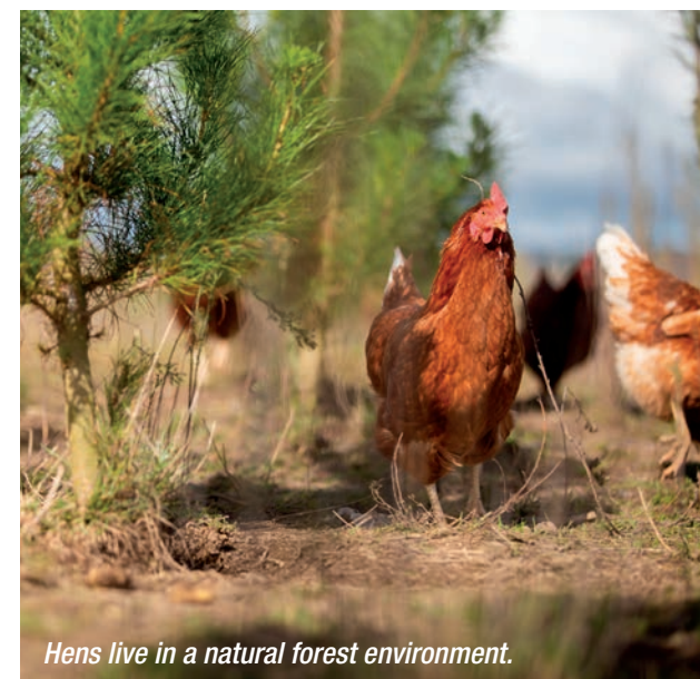
Hens live in a natural forest environment.