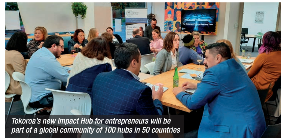
Tokoroa's new Impact Hub for entrepreneurs will be part of a global community of 100 hubs in 50 countries

https://events.humanitix.com/build-your-own-website-ihw "We hope South Waikato and the wider Waikato community will embrace the hub and make great use of it. If you are looking for a friendly, uplifting space from which to work, run a workshop or host a meeting then visit us at https://impacthubwaikato.co.nz locations, South Waikato, and our team will help you make it happen!"