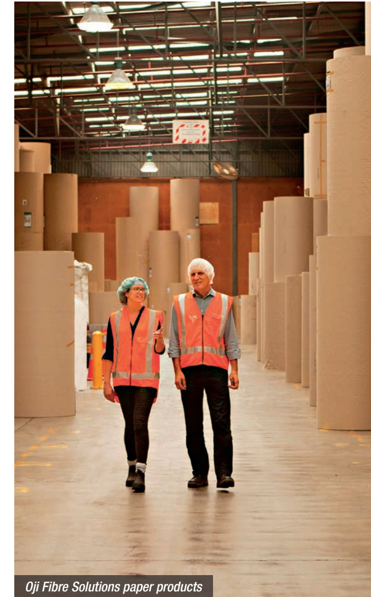
Oji Fibre Solutions paper products

city of the Waikato River. "We received great support from Raukawa, local mana whenua, and the community when we sought consents for Project Waikato, which were granted early this year." Millichamp said the project is driven by Oji's aspiration to achieve zero environmental burden. Oji Fibre Solutions is South Waikato's largest employer with 450 directly employed at Kinleith and 1800 across New Zealand and Australia. The site is New Zealand's largest producer of bio-renewable energy, using just under 14 million gigajoules per year of biomass. With gross revenue of $1.2 billion across its New Zealand and Australian operations, the company is also a significant contributor to the local