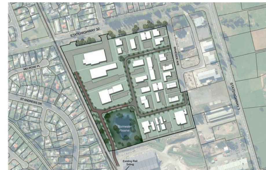
Left: Indicative plan of Maraetai Road Intermodal Business Park

When considered alongside the development of the Ruakura Superhub, it means the Waikato Region has a range of intermodal options for leasehold tenants and cus-