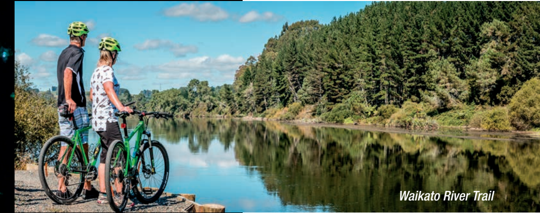
Waikato River Trail