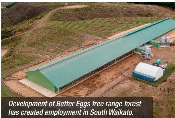
Development of Better Eggs free range forest has created employment in South Waikato.