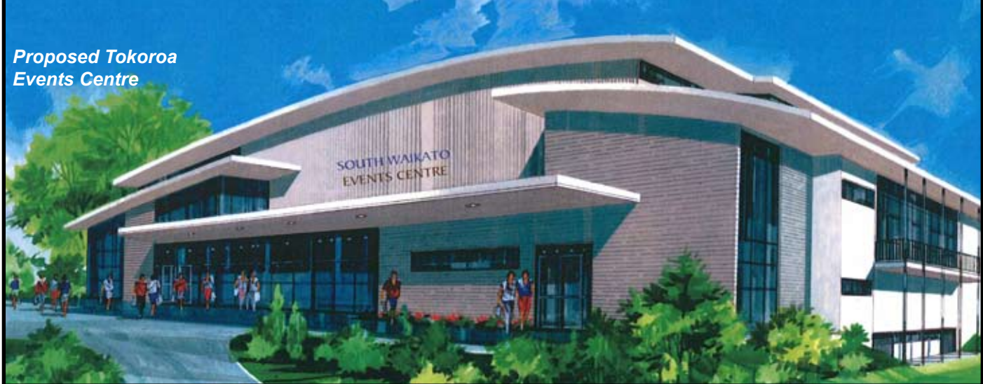
Proposed Tokoroa Events Centre