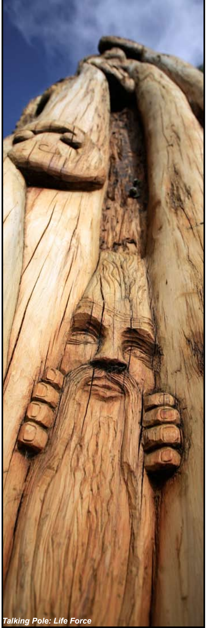
Talking Pole: Life Force