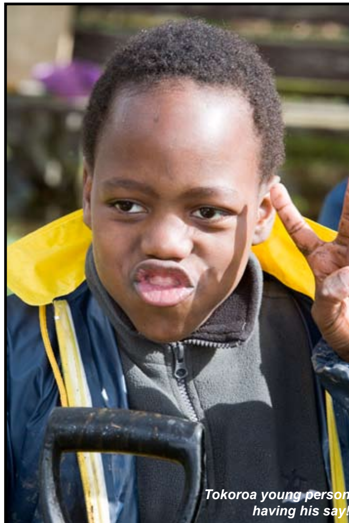
Tokoroa young person having his say!