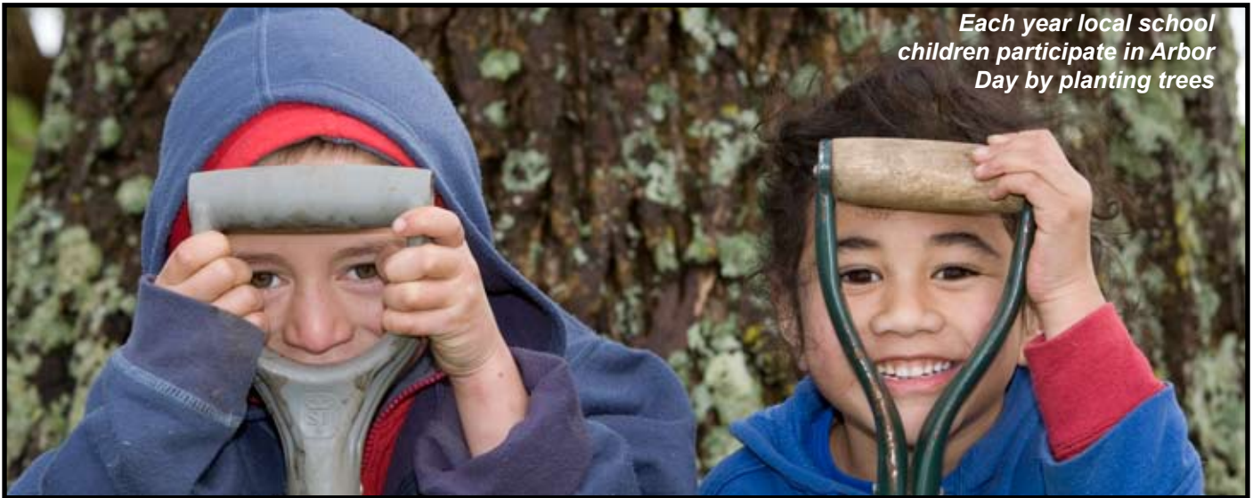
Each year local school children participate in Arbor Day by planting trees