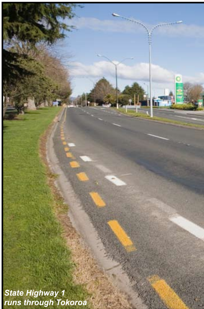
State Highway 1 runs through Tokoroa

During 2008, Council and Transit New Zealand are undertaking research and planning to improve urban design along State Highway One including signage options. The Transport Corridor (SH1) Strategy will take a long-term view. Any major changes to the current design of State Highway One or CBD entranceways will be undertaken only following opportunities for public input.