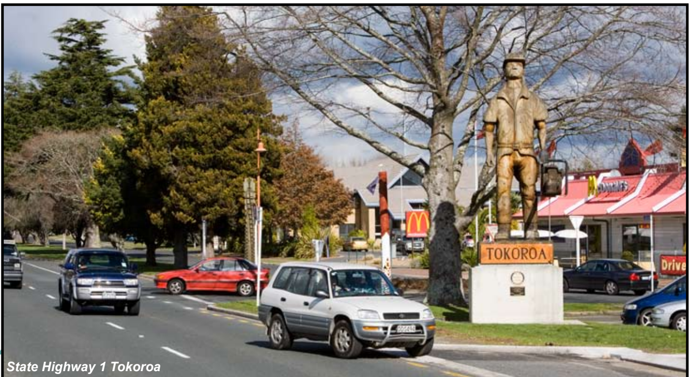
State Highway 1 Tokoroa

This Draft is open for public feedback during August/September 2008.