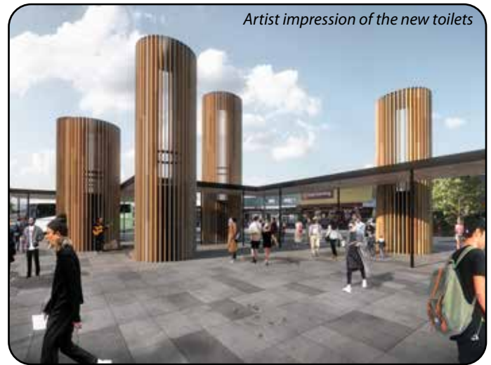
Artist impression of the new toilets

We thank the residents of Tokoroa for embracing the CBD project, for your patience. Check out our website for more updates: www.southwaikato.govt.nz - Our Council - Major Projects.