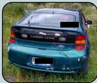
A couple of cars removed from around the district recently and stored while Council continues through the process.

Council staff must follow several steps before lawfully removing and disposing of a vehicle; consequently.