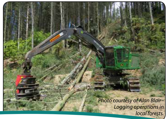
Logging operations in local forests.

Forestry has a long history in the South Waikato District with parts of the HFM forest currently being replanted with the fourth rotation of trees on that area of land.