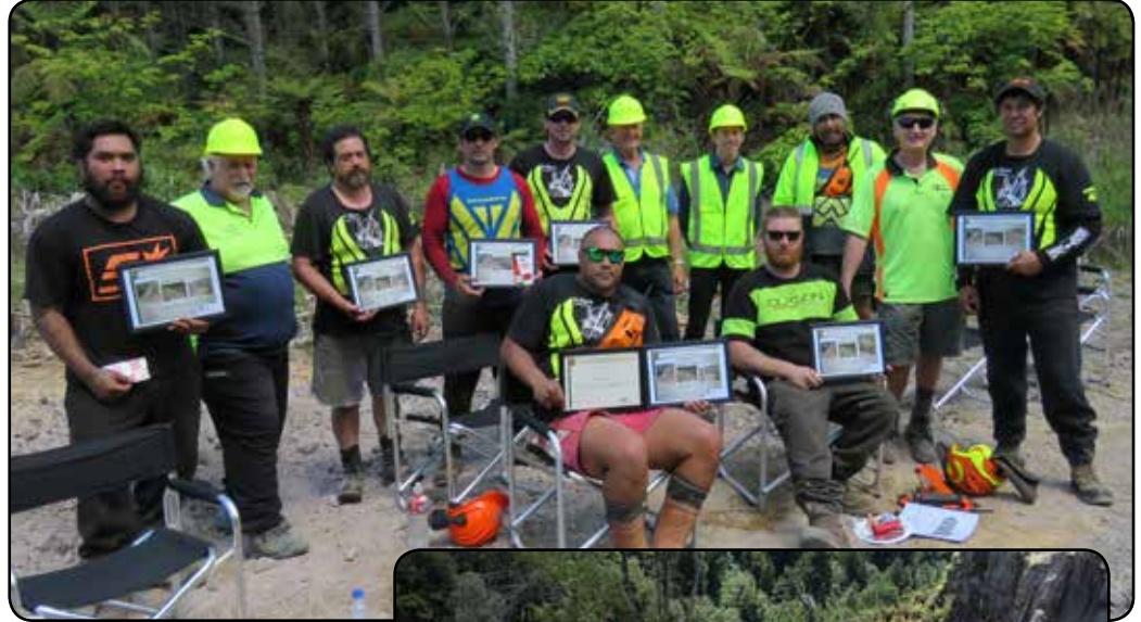
Crew 40 from Gareth White Logging took time out to receive commendation certificates from Councillor Herman van Rooijen, recognising their efforts in protecting biodiversity.

harvesting the team review the harvest plan, identify hazards and decide how to extract the logs with minimum impact on the pocket of natural vegetation. Their efforts on this particular site has resulted in the continued protection of 35 hectares of natural bush containing large old podocarp trees nestled among third rotation forestry land.