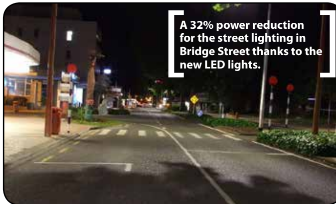
A 32% power reduction for the street lighting in Bridge Street thanks to the new LED lights.

Compliments from our facebook users on the BBQs and exercise equipment at Lake Moananui - thank you for letting Council know. Great to see so many people out there enjoying the sunshine and our beautiful lake.