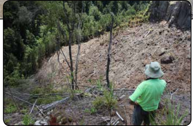
The steepness of the slope that was felled and closeness to the natural pocket of native vegetation alongside meant that felling and extracting the logs with minimal amount of damage was complex and time-consuming. Leaving the natural bush area intact for rare and protected species of falcon and birds is a goal the team are proud to work towards.

According to Mr White you can plan these areas prior to harvest but it takes a good team of