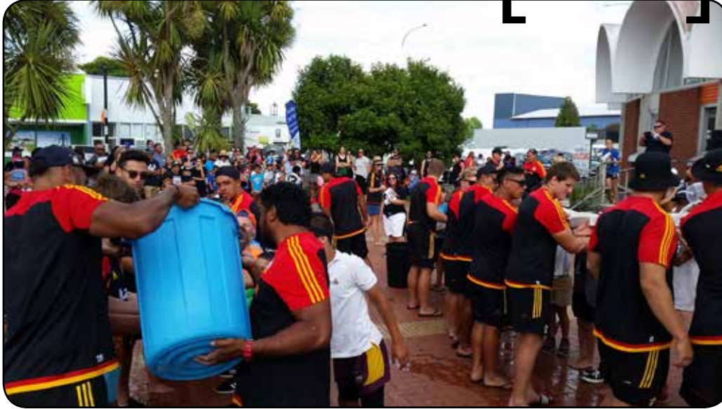
The Gallagher Chiefs visiting our district.

Animal Control receiving three compliments from people in our community during December, great feedback over a busy period.