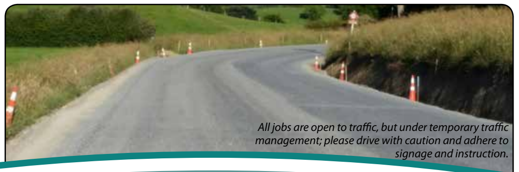
All jobs are open to traffic, but under temporary traffic management; please drive with caution and adhere to signage and instruction.

approximately five metres from the existing edge of the seal. The work involves a 200 to 300 metre section of road just before the Leslie Road carpark for the increasingly popular Te Waihou Walkway. The first stage of the project is expected to take between six to eight weeks.