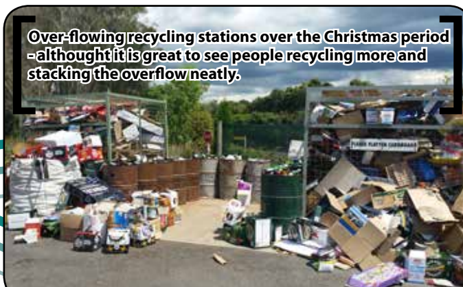
Over-flowing recycling stations over the Christmas period - although it is great to see people recycling more and stacking the overflow neatly.

Youth lighting fires in our public toilets.