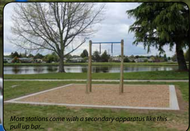
Most stations come with a secondary apparatus like this pull up bar...