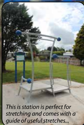
This station is perfect for stretching and comes with a guide of useful stretches...