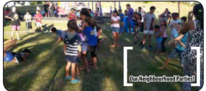
Our Neighbourhood Parties!

Tokoroa Library again! This time for being nominated as a finalist in the National Māori Language Awards... decision pending at the time of writing. Let's hope we bring home a win, but making finalist is super cool too!