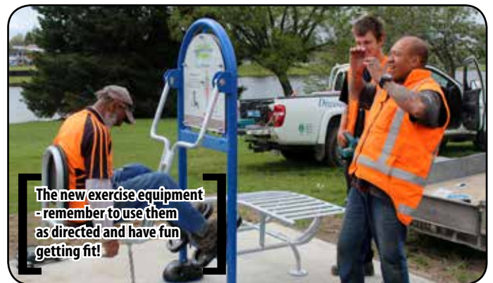
The new exercise equipment - remember to use them as directed and have fun getting fit!