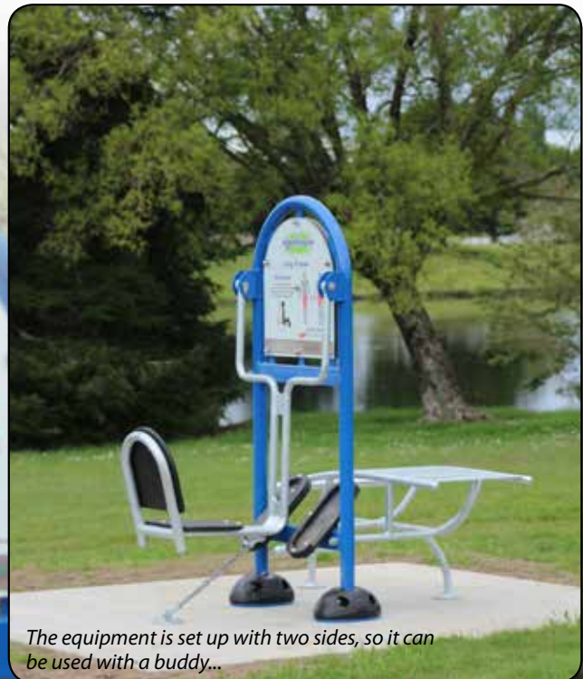
The equipment is set up with two sides, so it can be used with a buddy...