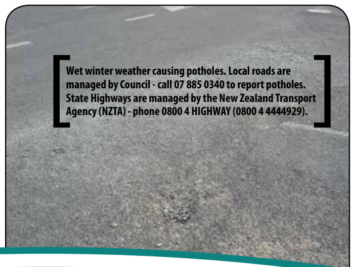
Wet winter weather causing potholes. Local roads are managed by Council - call 07 885 0340 to report potholes. State Highways are managed by the New Zealand Transport Agency (NZTA) - phone 0800 4 HIGHWAY (0800 4 4444929).

Frosty mornings causing slippery roads and footpaths - an appeal to our community to drive and walk carefully, look for problem areas and let us know - call 07 885 0340. It is unfortunately difficult to find a solution that works in icy conditions; so great care must be taken.