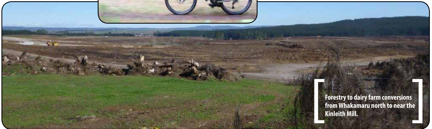
Forestry to dairy farm conversions from Whakamaru north to near the Kinleith Mill.

New BP opening soon in Tirau - always good to see new business developments and great when a big business chain sees value in investing in our district.