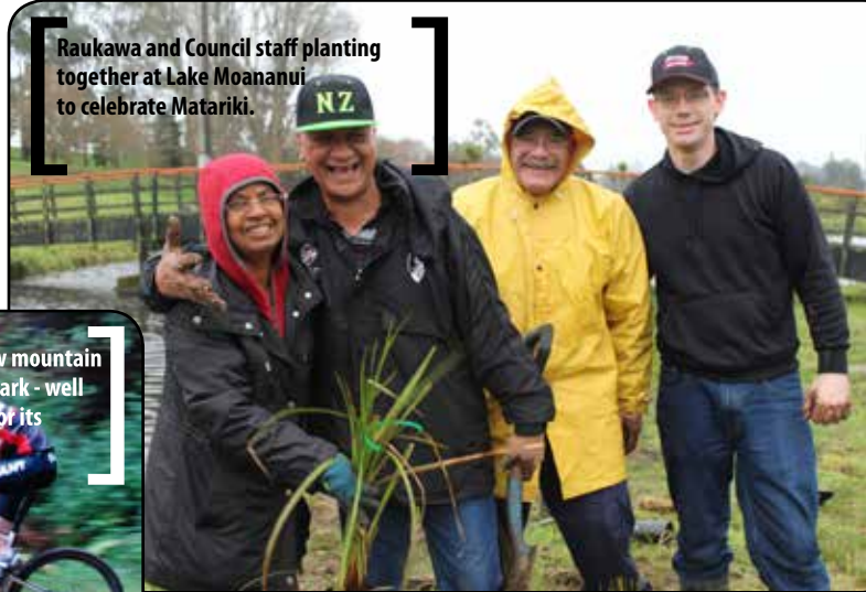
Raukawa and Council staff planting together at Lake Moananui to celebrate Matariki.