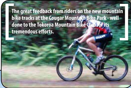
The great feedback from riders on the new mountain bike tracks at the Cougar Mountain Bike Park - well done to the Tokoroa Mountain Bike Club for its tremendous efforts.

Safety improvements on the Hetherington and Okoroire Road intersection.