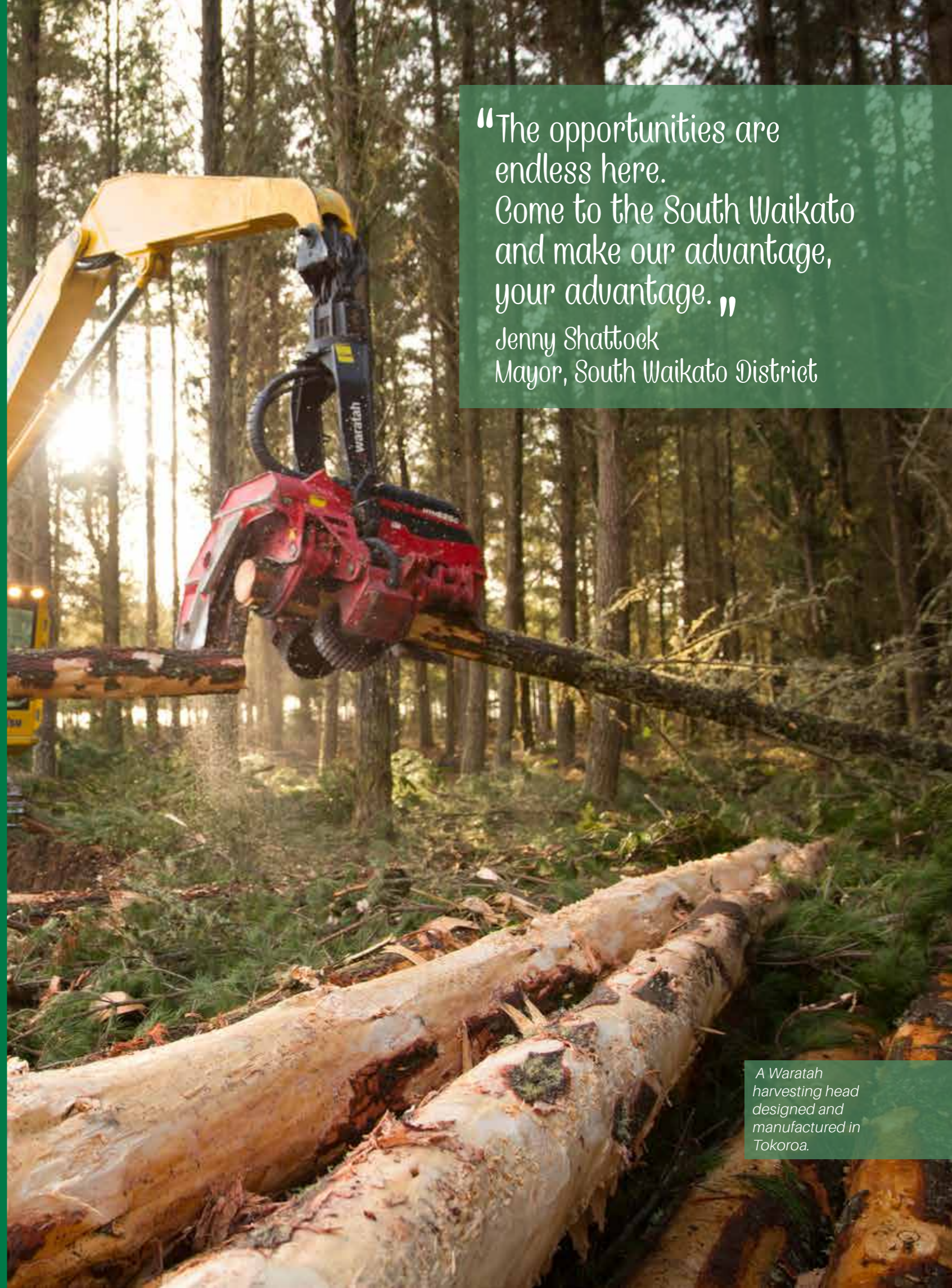
A Waratah harvesting head designed and manufactured in Tokoroa.