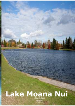
Lake Moana Nui